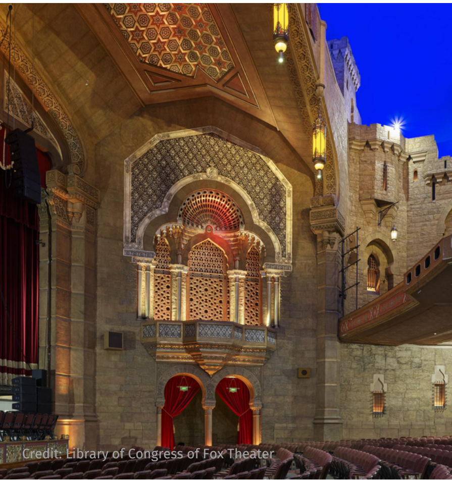
of Fox Theater

we are the only city in the US to have been home to teams from all five major professional sports leagues: the NFL (Falcons), MLB (Braves), NBA (Hawks), NHL (Thrashers, now relocated to Winnipeg), and MLS (United).